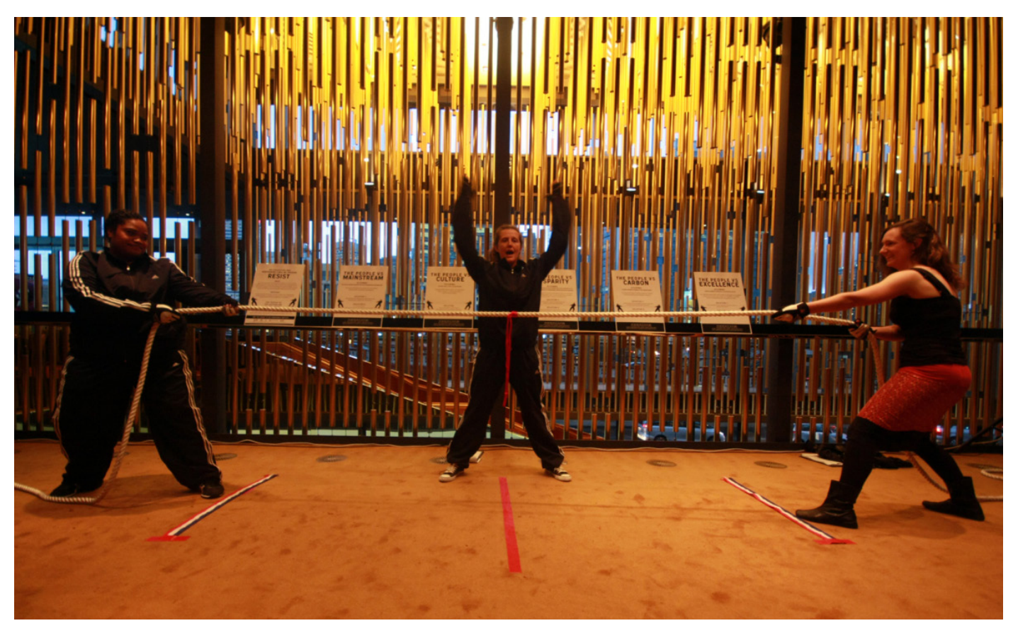
Image: pvi collective, resist: the cultural policy, 2011