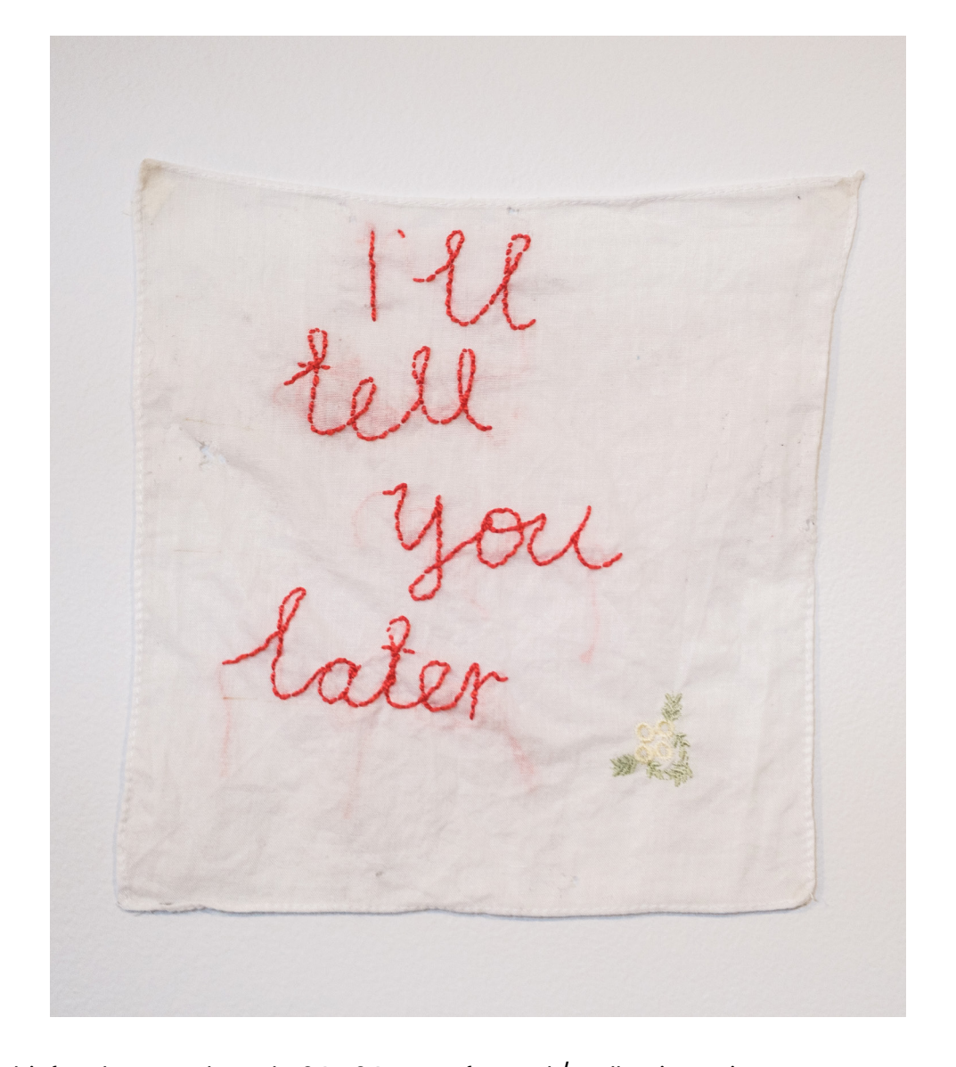
Image: WRIGHT, Sue Jo, b. 1975 / I'll Tell You Later 2021 / White handkerchief, red cotton threads, 24 x 24 cm unframed / Collection: Private Collection. © Sue Jo Wright / Cited on 21/09/2022