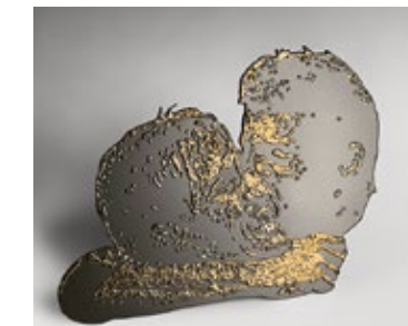
Gijs Bakker, Gonzalez , brooch, Go for Gold series, 2013

10.10am Keynote & Q&A Gijs Bakker: Without concept, no craft A product must have a soul – to be able to communicate, to tell a story.