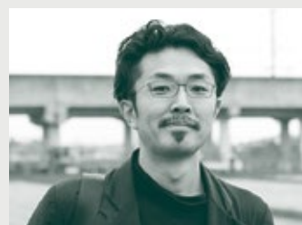
Shun Horiki East Japan Project, Tokyo, Japan e-j-p.org