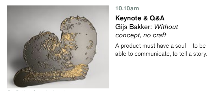
Go for Gold series, 2013