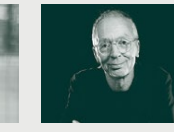
Gijs Bakker Amsterdam, The Netherlands gijsbakker.com/home